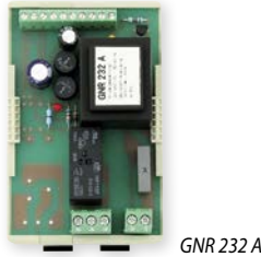
GNR 232 A