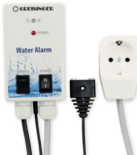
Figure GEWAS 181 A