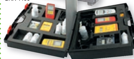
Color may vary.