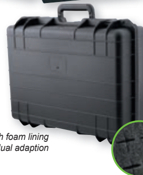
GKK 5240 with foam lining for individual adaption